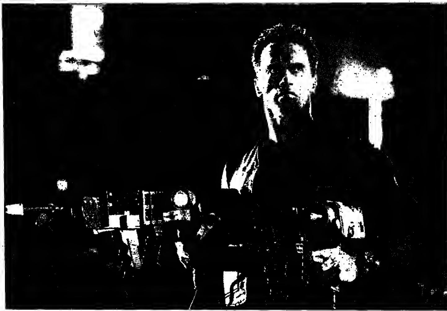
Trigger happy: Don't jump the line when Schwarzenegger's out shopping.

ONE of the ugliest, noisiest, crudest and most upsetting action pictures in recent memory, Eraser marks a gruesome new low in the history of the genre. In more immediate, physical terms, 107 minutes of nearly constant violent climax are enough to leave anyone dizzy and shaking; three-quarters of an hour after the film ended, my ears still rang and my teeth continued to ache from protracted gritting. Eraser is not entertaining; it's obvious and cruel and it batters an audience into passive submission. The movie works like one of the high-power assault weapons it glorifies, blasting away any last trace of our sensitivity before we've even had a few seconds to think or feel. Then it riddles us with gory effects till we flop there, limp and defeated, too exhausted by the barrage to protest. In comparison, this summer's other action movies — Independence Day , Mission Impossible — come to seem subtly comic, dramatically refined and morally downright commendable. The main difference between those films and Eraser lies in the former's sense of daredevil play and jockey self-deprecation, alongside the latter's grimly straight-